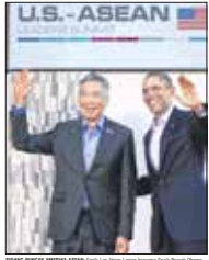
Presiden Obama bertemu dengan pemimpin-pemimpin ASEAN di Gedung Putih, Washington, DC, pada hari Selasa.

BANJO WIRAGI Amerika Serikat Presiden Barack Obama mengatakan bahwa Amerika Serikat dan negara-negara Asia Tenggara dapat berkolaborasi untuk menangani masalah-masalah kelautan secara aman. Obama mengatakan bahwa Amerika Serikat dan negara-negara Asia Tenggara dapat berkolaborasi untuk menangani masalah-masalah kelautan secara aman. Obama mengatakan bahwa Amerika Serikat dan negara-negara Asia Tenggara dapat berkolaborasi untuk menangani masalah-masalah kelautan secara aman.