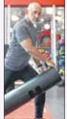
Seorang pekerja pabrik makanan di Singapura mengatakan bahwa dia merasa lebih percaya diri dan gagah sekarang dibandingkan dulu.

Seorang pekerja pabrik makanan di Singapura mengatakan bahwa dia merasa lebih percaya diri dan gagah sekarang dibandingkan dulu. Dia mengatakan bahwa dia merasa lebih percaya diri dan gagah sekarang dibandingkan dulu. Dia mengatakan bahwa dia merasa lebih percaya diri dan gagah sekarang dibandingkan dulu.