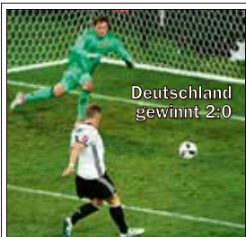
Deutschland gewinnt 2:0

We are a medium-sized publishing company that, besides "Wilhelmshavener Zeitung", publishes two additional daily newspapers in the "Wilhelmshavener newspaper group" ("Jeversches Wochenblatt" and "Anzeiger für Harlingerland"). "Emder Zeitung" is also printed in Wilhelmshaven. Total print run is 52,248 copies.